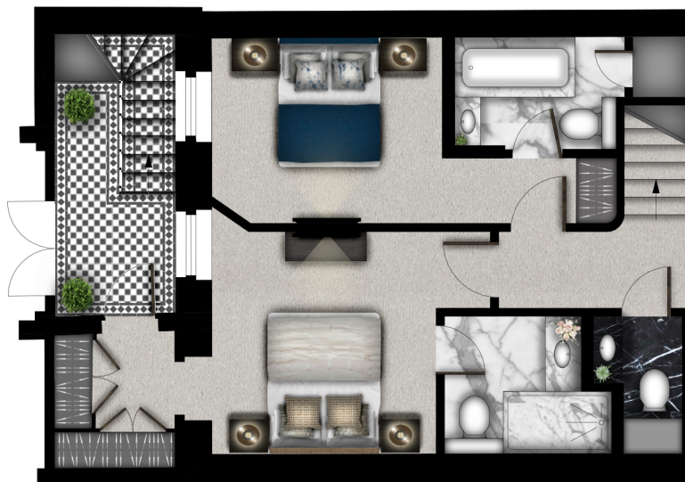
COURT YARD LEVEL